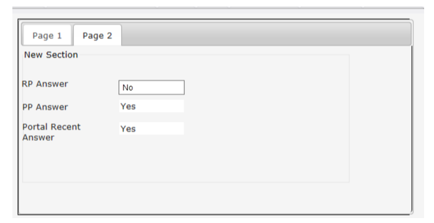
THE SAME QUESTION MAPPED TO THREE SOURCES.

Since questions can be answered differently by the referring doctor and the patient, a new read-only Portal Question Recent Answer column has been added to the Digital Form Editor that prioritizes the patient response - it will always display the Patient Portal response if one exists, otherwise it will use the Provider Portal response.